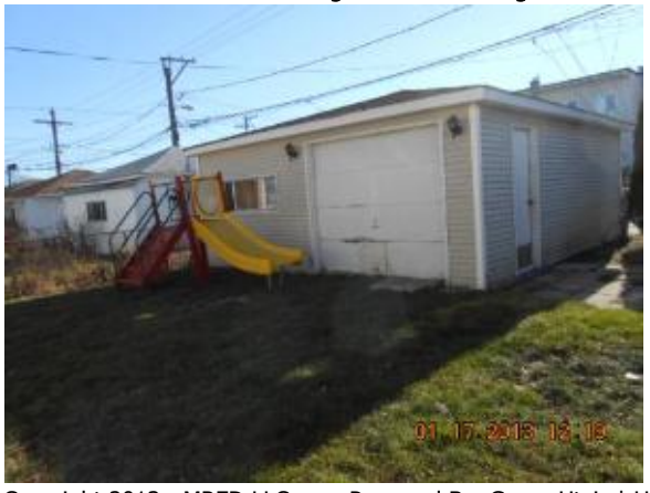
MLS#: 08251849 Detached Single 4825 W Wellington ST Chicago IL 60641