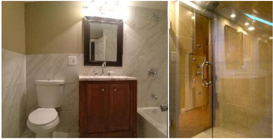
MLS#: 08225357 Detached Single 5149 W Fletcher ST Chicago IL 60641