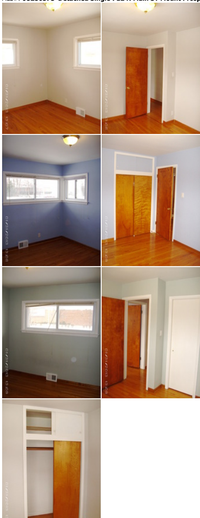
MLS#: 08286573 Detached Single 712 N Main ST Mount Prospect IL 60056