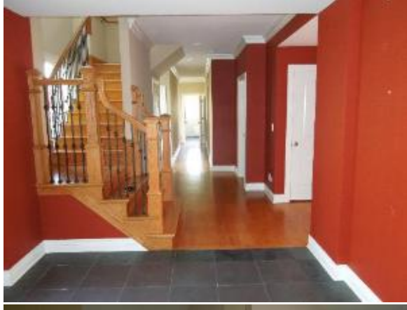
MLS#: 08282233 Detached Single 4107 N Kilbourn AVE Chicago IL 60641