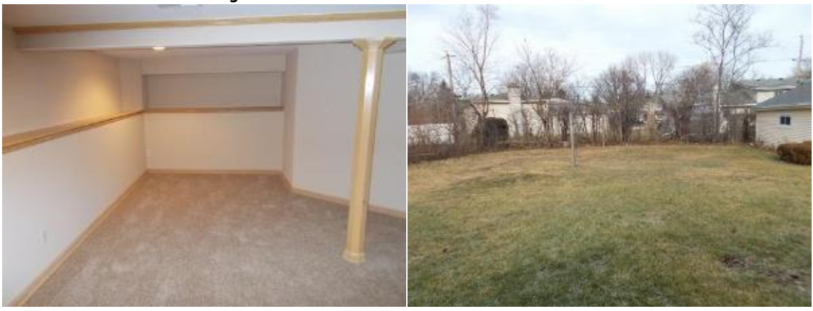
MLS#: 08282449 Detached Single 2808 Norma CT Glenview IL 60025