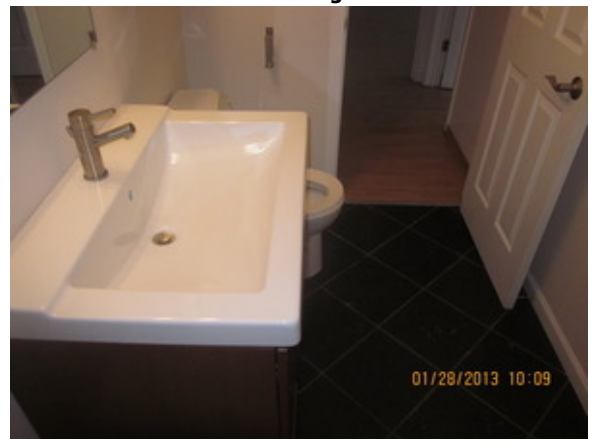
MLS#: 08281239 Attached Single 7234 W North AVE Unit #: 1002 Elmwood Park IL 60707