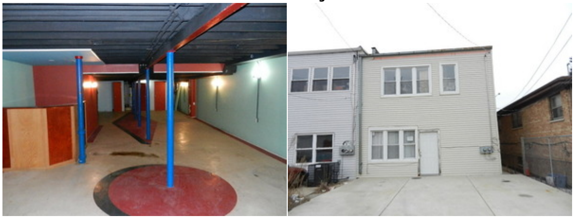
MLS#: 08284536 Two to Four Units 6207 W Grand AVE Chicago IL 60639