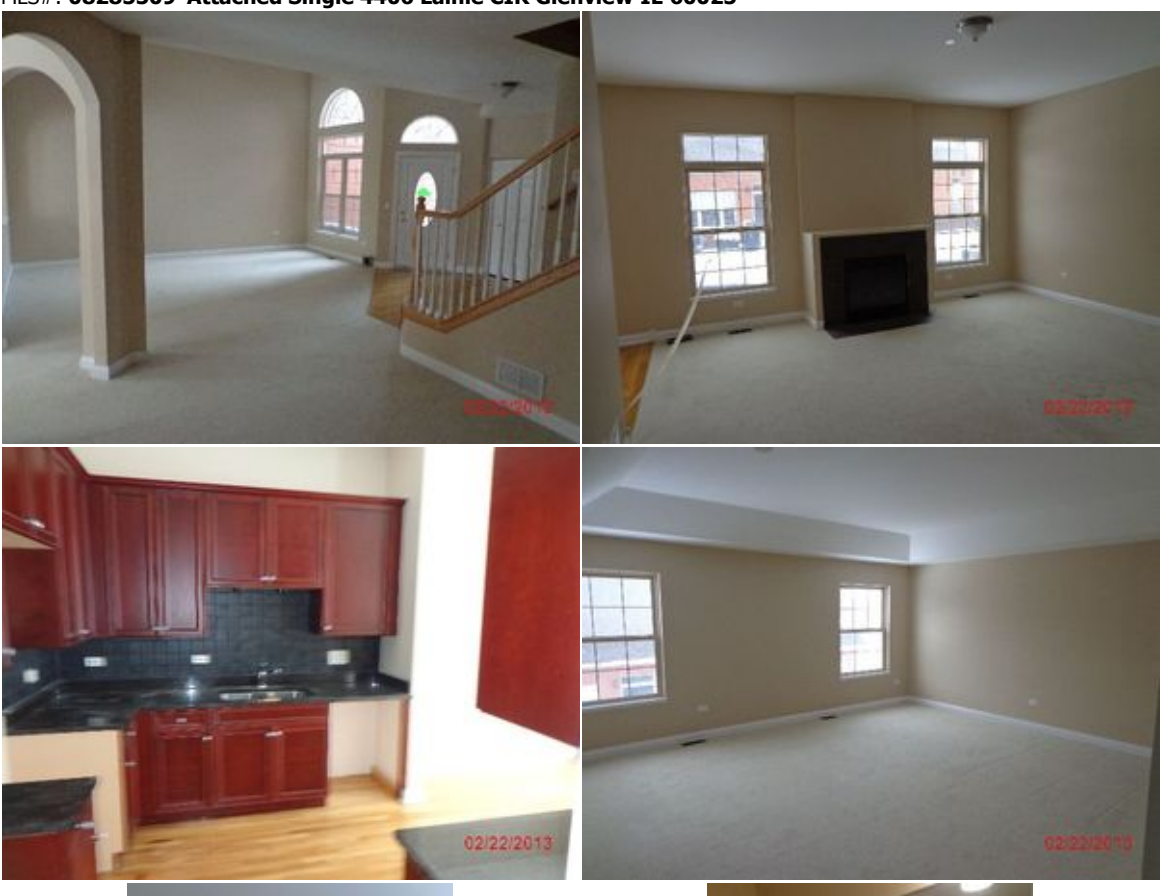
MLS#: 08285509 Attached Single 4406 Lainie CIR Glenview IL 60025