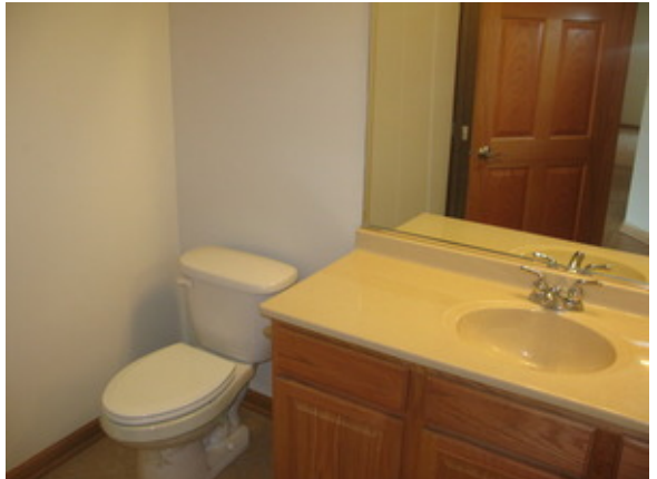
MLS#: 08283008 Attached Single 6559 W George ST Unit #: 315 Chicago IL 60634