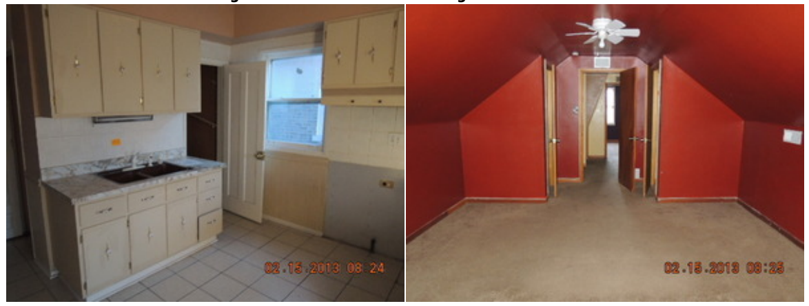
MLS#: 08285588 Detached Single 5031 W Wolfram AVE Chicago IL 60641