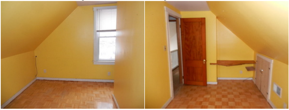
MLS#: 08283402 Detached Single 5647 W Berenice AVE Chicago IL 60634