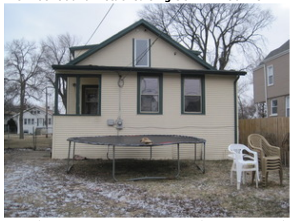
MLS#: 08286616 Detached Single 9712 W Schiller BLVD Franklin Park IL 60131