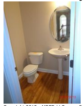
MLS#: 08285509 Attached Single 4406 Lainie CIR Glenview IL 60025