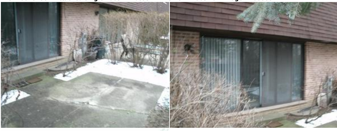
MLS#: 08281387 Attached Single 1063 W Busse HWY Unit #: 1063 Park Ridge IL 60068